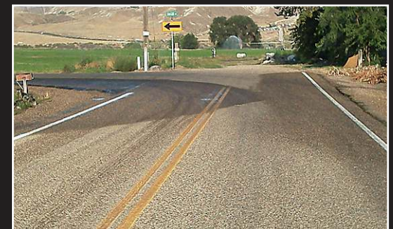
Water on the roads is a dangerous hazard for drivers.

Contact your local Highway District for more information or Sheriff's Office to report a violation at (208) 454-7531.