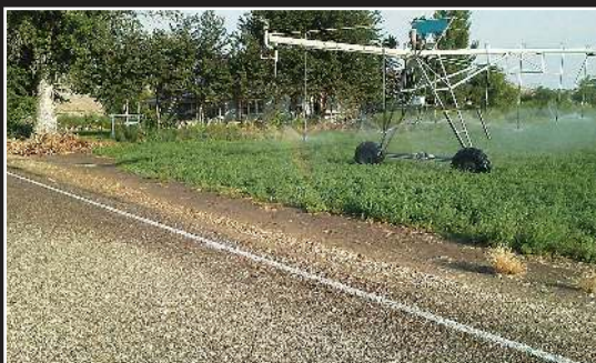
Water spraying across our rural roads DOES create a safety hazard.