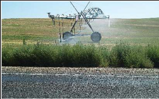
Water on the road causes drivers to drive on the wrong side to avoid getting wet.