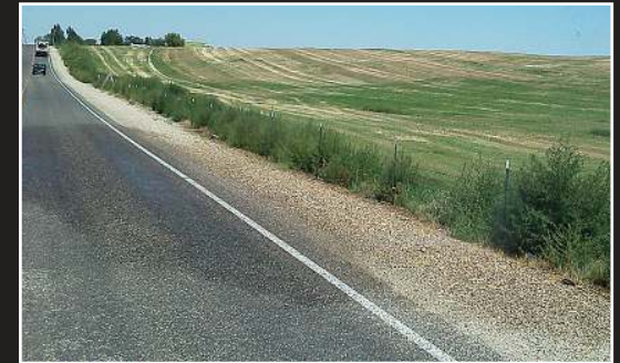
Weather conditions / moisture can create slick roads.