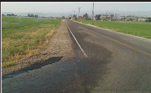
Sprinklers spraying water on the roads is a safety hazard.